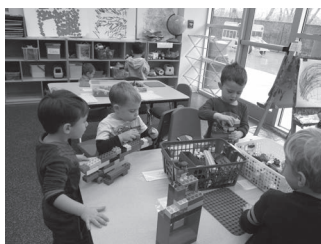
Our Busy 3 Year Olds

We are getting very busy preparing for our biggest fund raiser of the year: "Art in the Afternoon." We have an incredibly dedicated group of parents working very hard to plan the event on Sunday, March 15. This is a time to showcase the many talents of our children, for families to get together and to spend