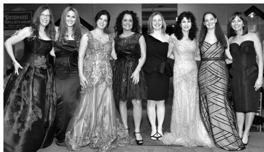
Our elegant models!

Following on the heels of a wonderful Fall Fashion Gala, our second annual Games Day & Luncheon , co-sponsored by Roslyn Hadassah, will take place on Wednesday, February 11, beginning at 10 A.M. Bring your game and bring your cards, bridge or mah jongg group for a most enjoyable day. Please watch for your invitation in early January.