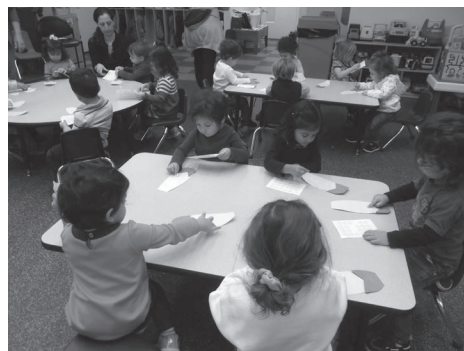
Craft Time With The 2's

Registration for the 2015 – 2016 school year has begun. If you or anyone you know are interested in finding out more about our school or to arrange for a tour, please call us at 621-1171.