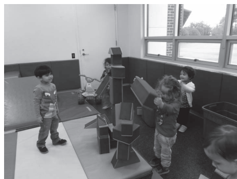
Play Time is Fun Time