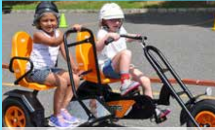
FUN FOR AGES 3-15 Flexible 4-8 Week Sessions

Door to door transportation in air conditioned buses Two snacks & lunch all Glatt Kosher & Nut Free