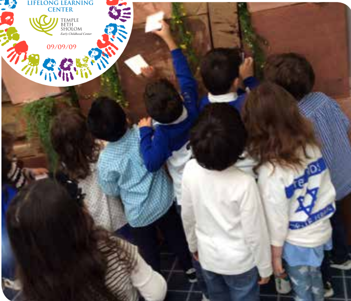
Putting our wishes in the Kotel