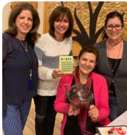
We had so much fun at our last board meeting playing bingo!

for 2019 – 2020 who will be installed that evening. Please come and show your support! (Check out our slate of officers posted in the lobby.)