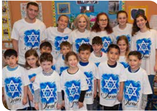
TBS Religious School celebrates Israel!