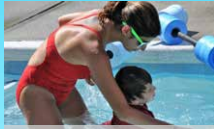
AMERICAN RED CROSS SWIM in our 3 onsite heated pools