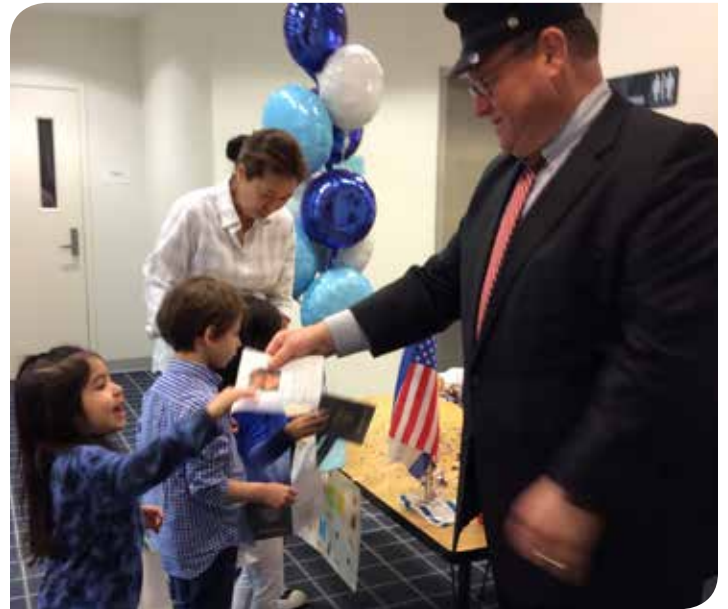
Going through airport security on our way to Israel