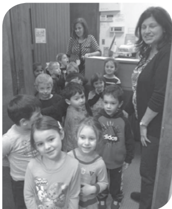
Shabbat visit to the Temple office by the nursery school.