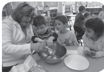
Cooking with the Four's