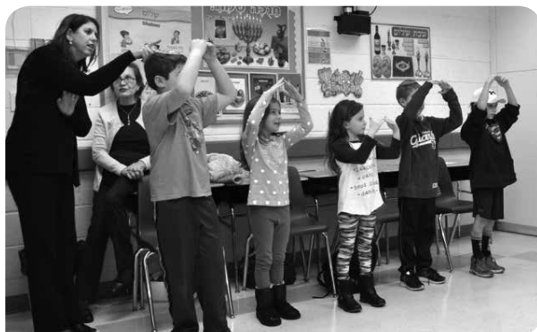
Gimel class learning Hebrew through Movement

The Daled/Hay Shabbat will take place on Saturday morning, April 16 th . All fourth and fifth grade families should plan to attend this special grade Shabbat program as students will lead the Shabbat morning Shacharit