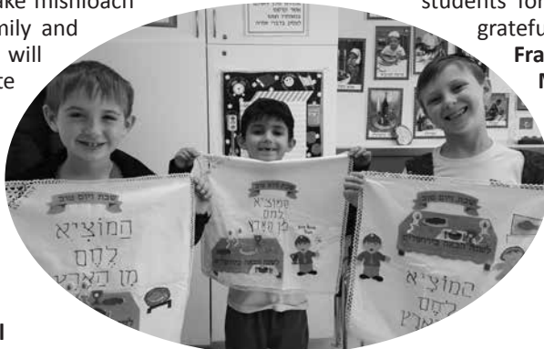
Bet 2nd graders made beautiful Challah covers