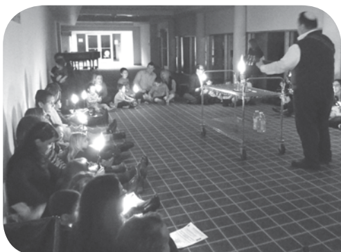
Hooray for Havdalah