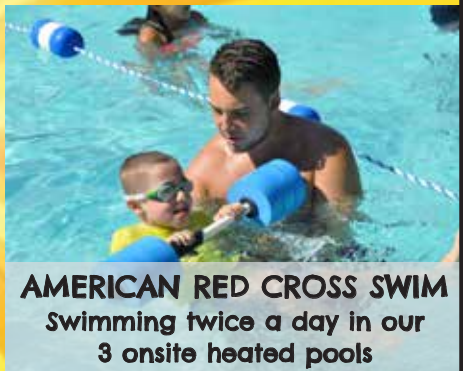
AMERICAN RED CROSS SWIM Swimming twice a day in our 3 onsite heated pools