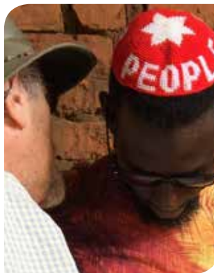
Cantors Assembly member connecting with member of the Abayudaya community.