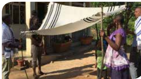
Cantors Assembly members donated a Torah

Shabbat, kashrut etc. For more information look them up on Google - its a very interesting read. Mbale is the epicenter of the Abayudaya community and radiating out from Mbale are numerous villages which are home to a number of Abayudaya synagogues. My colleagues also participated in teaching in their local "Jewish" schools, davening together with the Abayudaya in their synagogues, interviewing them and bringing back extensive footage of everything they did. They even made extensive video and audio recordings, including spending over eight hours in a studio recording the music of Abuyadaya while in Kampala, the capital city. At some point this will be made into a movie, which I hope to be able to screen for our congregation as part of our annual movie series.