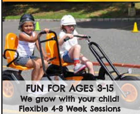
FUN FOR AGES 3-15 We grow with your child! Flexible 4-8 Week Sessions