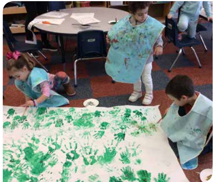
Putting leaves on the tree for Tu B'Shevat

Tell your friends and families about our wonderful preschool programs here at the Early Childhood Center. For registration information contact us at (516) 621-1171.