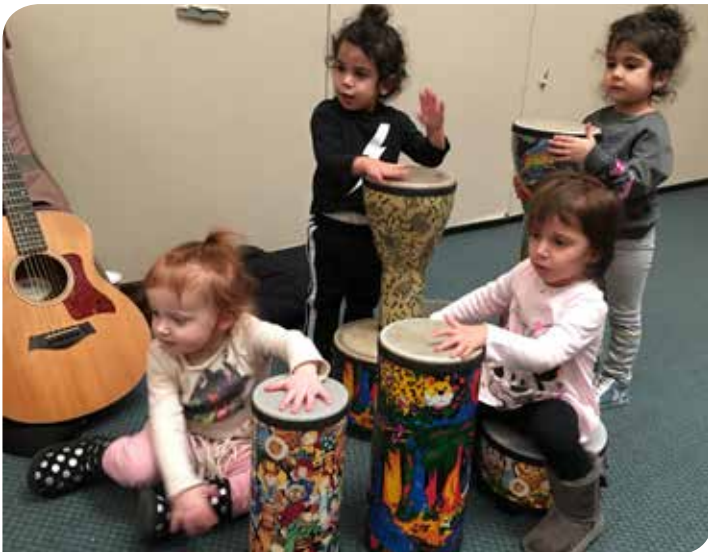
Toddlers beating the drums

If you or anyone you know would like to know more about our school, please call us at (516) 621-1171.