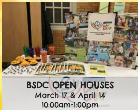
BSDC OPEN HOUSES March 17 & April 14 10:00am-1:00pm