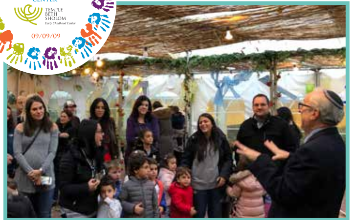
Blessings in the Sukkah

Mini Minyan: Come join other young families with children 0 to 5 years old for this interactive and fun Shabbat morning service. Mini Minyan is held in the Youth Lounge from 10:45-11:45 on November 2, 9, 23 December 7, 14