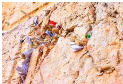
Kavanah, July 2016 Women's Side of the Wall