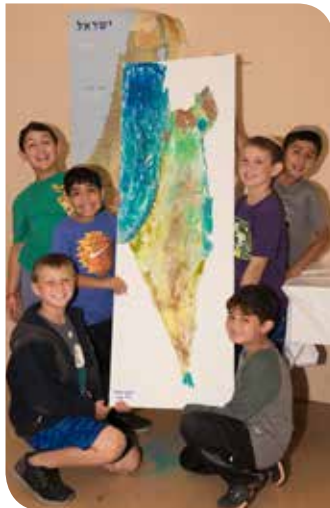
Connecting with Israel