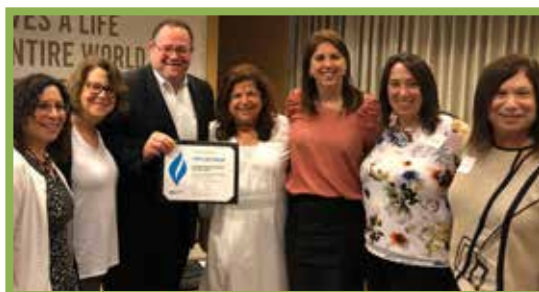
Temple Beth Shalom is awarded a certificate of completion for their synagogue inclusion project for the inclusion room.