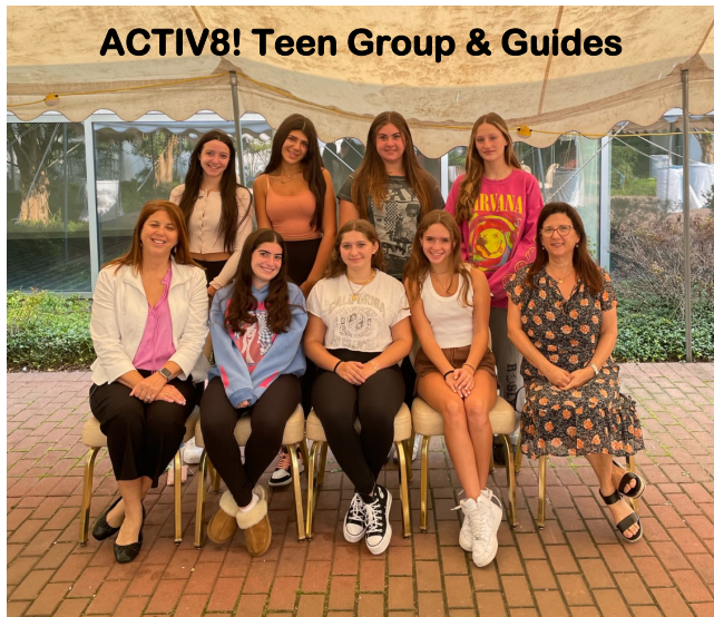
ACTIV8! Teen Group & Guides

(right top) ACTIV8! Board addresses the Religious School student body at their opening assembly on 9/11/22 about the most recent ACTIV8! initiative and the Religious School "Mitzvah of the Month"—the breakfast cereal collection campaign.